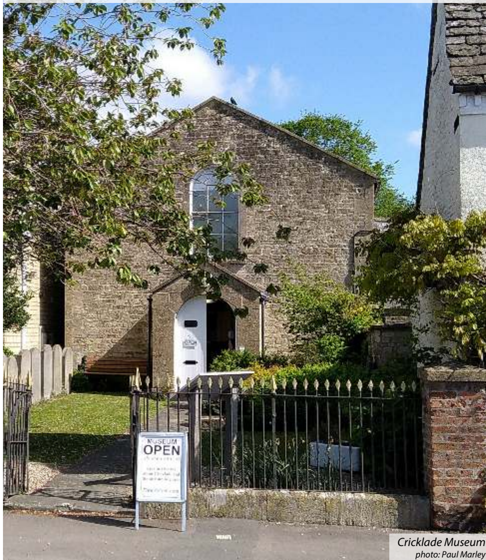
Cricklade Museum photo: Paul Marley